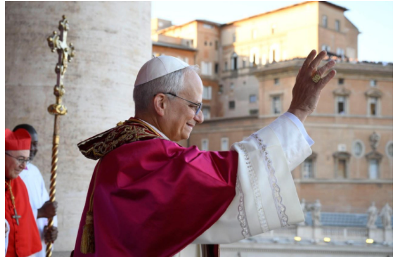
Pope Leo XIV appears on the balcony of St. Peter's Basilica

The following year, he joined the mission in Trujillo, also in Peru, as director of the joint formation project