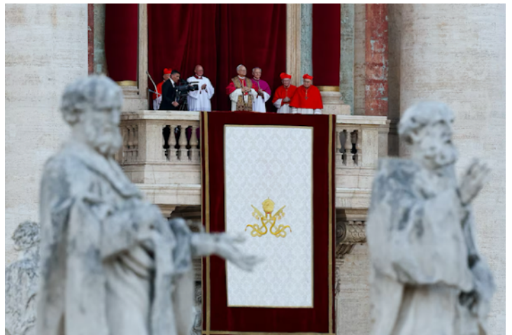
Newly elected Pope Leo XIV, Cardinal Robert Prevost of the United States appears on the balcony of St. Peter's Basilica, at the Vatican, May 8, 2025.

Leo's first clue was his choice of name. Popes often use this choice to send their first major signal about the priorities of their new papacy.