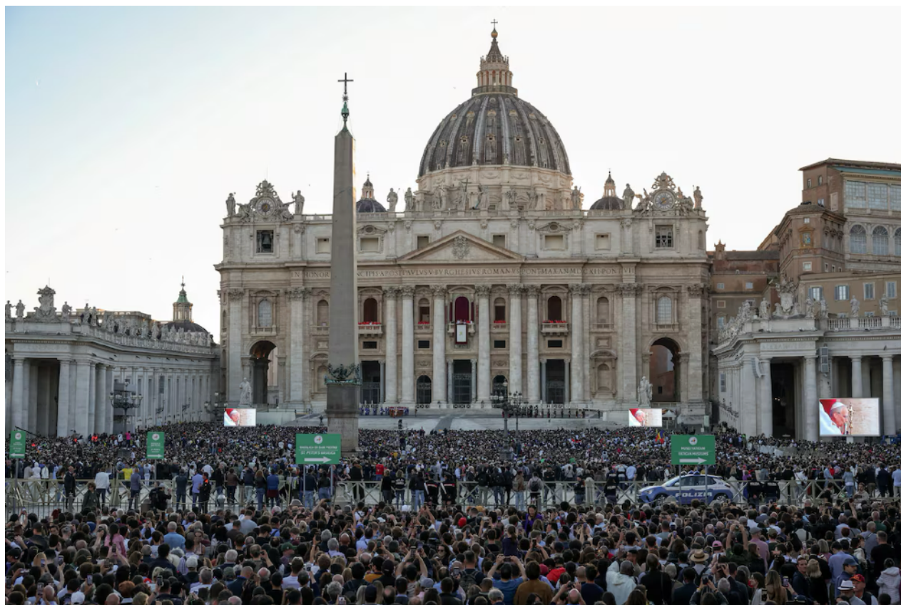
People watch as newly elected Pope Leo XIV, Cardinal Robert Prevost of United States appears on the balcony of St. Peter's Basilica, as seen from Rome, Italy May 8, 2025.