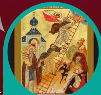
4 th Sunday of Lent: THE COMMEMORATION OF ST. JOHN OF THE LADDER