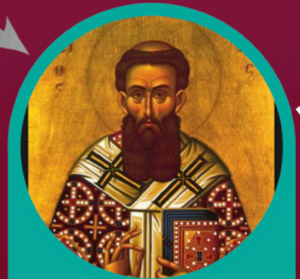
2 nd Sunday of Lent: COMMEMORATION OF ST. GREGORY PALAMAS

The Second Sunday of Lent is the commemoration of St Gregory Palamas . It was St. Gregory ( d.1359 ) who bore living witness that men can become divine through the grace of God in the Holy Spirit; and that even in this life, by prayer and fasting, human beings can become participants of the uncreated light of God's divine glory.