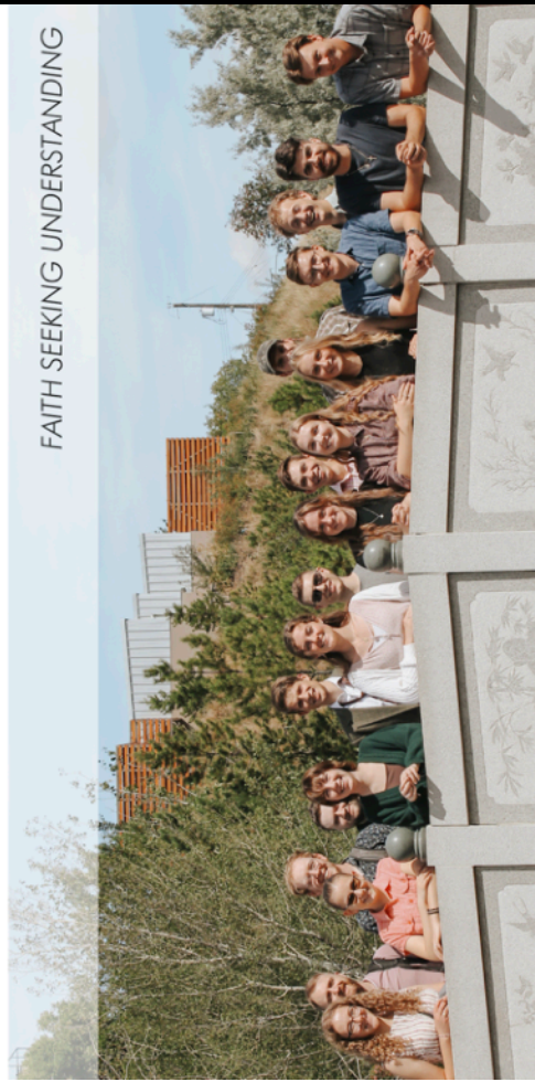
FAITH SEEKING UNDERSTANDING