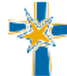
St. Gerard Catholic Elementary School