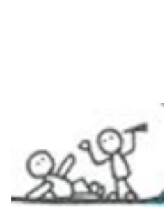
N: CAIN & ABLE