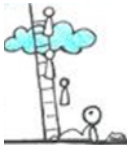
K: JACOB'S LADDER