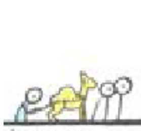
F: JOSEPH SOLD INTO SLAVERY