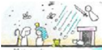
A: MOSES, PHARAOH AND THE 10 PLAGUES

Can you put these 19 Bible stories in chronological order?