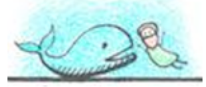
D: THE PROPHET JONAH