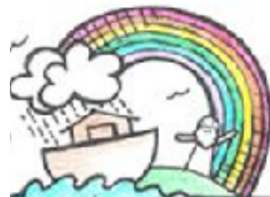
R: NOAH'S ARK