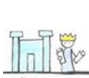
G: WISE KING SOLOMON