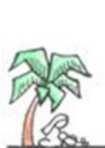
L: HAGAR & ISHMAEL