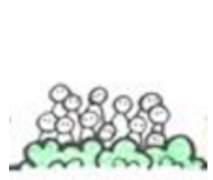
I: THE 12 SPIES