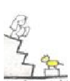
S: THE 10 COMMANDMENTS & THE GOLDEN CALF

Our Bible Study, that will take place every 2 nd Wednesday evening at 6 pm starting next week, will help us understand the BIG PICTURE of the STORY of Scripture, and what these stories mean for us. Join us in this great yet simple look through the whole Bible from the Creation to the Second Coming.