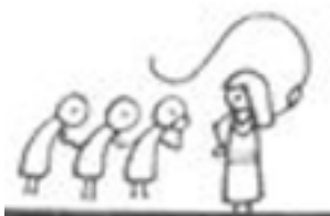
O: ISRAEL EXILED