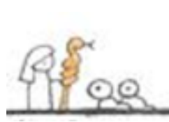
C: THE BRONZE SERPENT