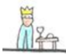
B: KING HEZEKIAH