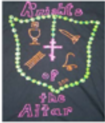
Please bring a rosary