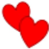
Table for Two - You are My Valentine

Table for Two is a romantic candlelit dinner for couples married or dating, which provides the ideal opportunity to focus on each other. Each of the courses is served up with discussion starters which invite couples to explore and deepen their relationship with each other and with God. A guest couple will give a short presentation on a topic related to sacramental marriage. Dietary restrictions will be accommodated within reason.