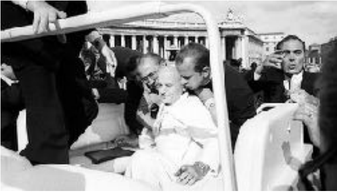
POPE JOHN PAUL II IS ASSISTED BY AIDES AFTER BEING SHOT IN ST. PETER'S SQUARE IN 1981.

The Pope's presence on the world stage began the gradual and peaceful removal of Communism from Eastern Europe, averted war between the nations of Chile and Argentina, and began the restoration of peace and the healing of division between the major world religions.