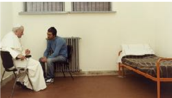
POPE JOHN PAUL II SITS WITH HIS WOULD-BE ASSASSIN, MEHMET ALI AGCA, IN ROME'S REBIBBIA PRISON IN 1983.

On May 13, 1981, Pope John Paul II was the victim of an attempted assassination in St. Peter's Square. Shocking the world, he exhibited extraordinary love and forgiveness when he made a personal visit to his attacker, Ali Agca, in Rebibbia Prison in 1983. Following his recovery, Pope John Paul II continued with his missionary activity, meeting with more than 17,600,000 pilgrims during General Audiences and countless millions of faithful during his subsequent pastoral visits throughout the world. He continued to meet