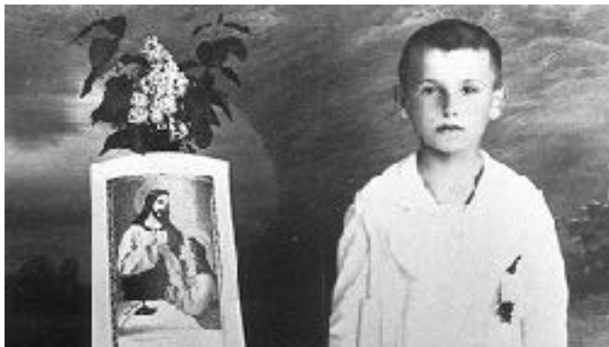
KAROL JÓZEF WOJTYŁA IS PICTURED AT HIS FIRST COMMUNION MAY 25, 1929.