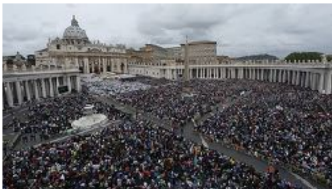
POPE FRANCIS CELEBRATES THE CANONIZATION MASS OF STS. JOHN XXIII AND JOHN PAUL II IN ST. PETER'S SQUARE AT THE VATICAN APRIL 27.

More than three million pilgrims traveled to Rome to pay homage to the pope, some standing in line for over 24 hours to pray in thanksgiving for their beloved Holy Father.