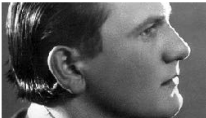
THIS PORTRAIT OF YOUNG KAROL JÓZEF WÓJTYŁA APPEARED IN A POSTER FOR THE STUDIO 39 THEATER GROUP.