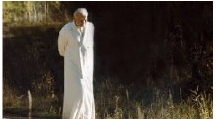
POPE JOHN PAUL II WALKS DOWN A GRAVEL PATH IN AN UNDATED PHOTO BY VATICAN PHOTOGRAPHER ARTURO MARI.

"The answer to the fear which darkens human existence at the end of the twentieth century is the common effort to build the civilization of love.... With the help of God's grace, we can build in the next century and the next millennium a civilization worthy of the human person, a true culture of freedom. We can and must do so!" — Pope John Paul II in his address to the United Nations