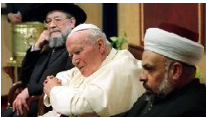
POPE JOHN PAUL II MEETS WITH JEWISH, MUSLIM LEADERS IN JERUSALEM IN 2000.

John Paul II successfully encouraged dialogue with the Jews and inaugurated a time of healing between Jews, Muslims and representatives of other religions. Several times he extended an invitation for these groups to participate in worldwide meetings to pray for peace.