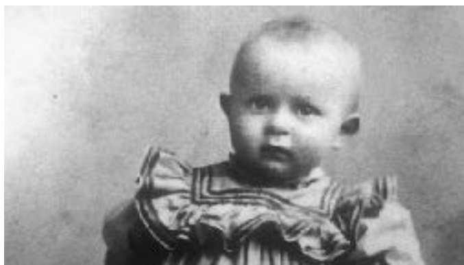
KAROL JÓZEF WOJTYŁA IS PICTURED AS A BOY IN WADOWICE, POLAND.