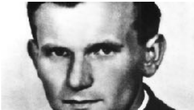
KAROL JÓZEF WOJTYŁA IS PICTURED AROUND THE TIME HE BECAME A PRIEST.

In order to remain in the country, Karol was forced to work in a stone quarry as well as night shifts at the Solvay chemical plant. During this time, Karol suffered the loss of his father, who died of a heart attack on February 18, 1941. In 1944, he miraculously survived being hit by a German truck. Through all this, he recounts the maturing of his vocation and the formation of his priestly identity.